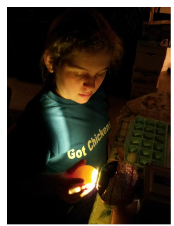
Figure 1. Candling eggs. Educational embryology projects such as those offered by 4-H groups allow children to learn how life develops through observing eggs in an incubator.

Infected birds shed flu virus in their saliva, nasal secretions, and feces. Susceptible birds become infected when they have contact with contaminated excretions or surfaces that are contaminated with excretions. It is believed that most cases of bird flu infection in humans have resulted from contact with infected poultry or contaminated surfaces.