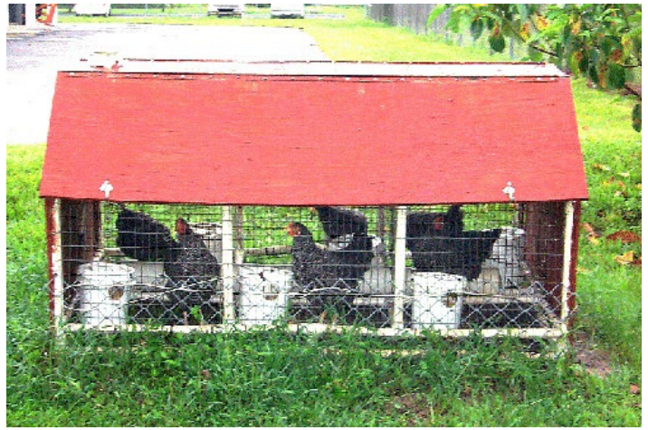
Figure 3. Sentinel chickens.