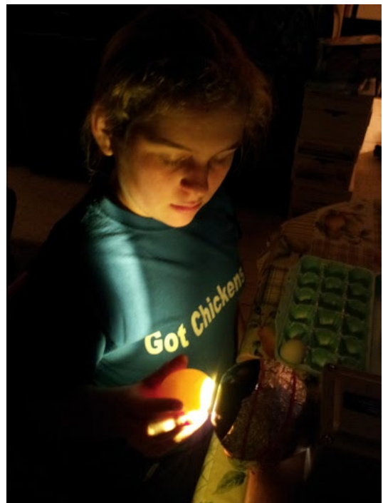
Figure 1. Candling eggs. Educational embryology projects such as those offered by 4-H groups allow children to learn how life develops through observing eggs in an incubator.

Infected birds shed flu virus in their saliva, nasal secretions, and feces. Susceptible birds become infected when they have contact with contaminated excretions or surfaces that are contaminated with excretions. It is believed that most cases of bird flu infection in humans have resulted from contact with infected poultry or contaminated surfaces.