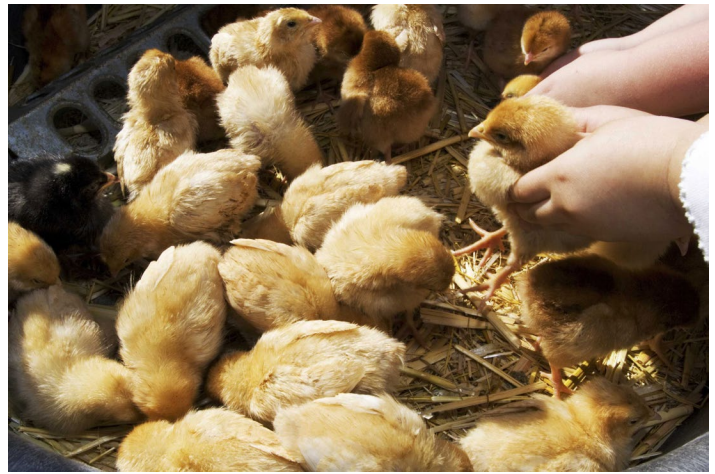
Figure 2. A risk of contracting Salmonella from chicks is always present. However, the risk can be reduced by avoiding contact with feces from these animals, carefully washing hands with soap and water after handling these animals, and avoiding hand-to-mouth contact.

Escherichia coli or E. coli is usually found in the digestive system of healthy humans and animals, and is transmitted through fecal contamination and contaminated foods and water. There are hundreds of known E. coli strains, but most of them are not disease-causing (pathogenic) strains. Illness from the pathogenic strains can range from very mild diarrhea to severe bloody diarrhea with Hemolytic Uremic Syndrome (HUS), leading to kidney failure and death. The E. coli O157:H7 was the source of an outbreak