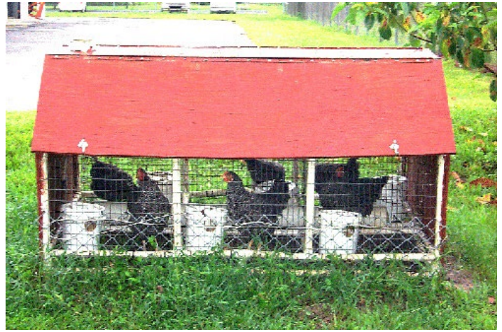
Figure 3. Sentinel chickens.